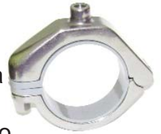
Housing with Gray inserts are "Guide" supports

Guides - Allows free axial movement for thermal expansion of tube or pipe