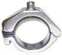
Housing with Black inserts are "Anchor" supports

One piece unit with threaded adaptor. Rod is sold separately.