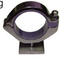
Housing with Gray inserts are "Guide" supports

Guides - Allows free axial movement for thermal expansion of tube or pipe