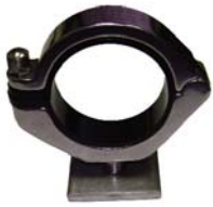
Housing with Black inserts are "Anchor" supports

One piece unit with weld plate attached to hanger housing.